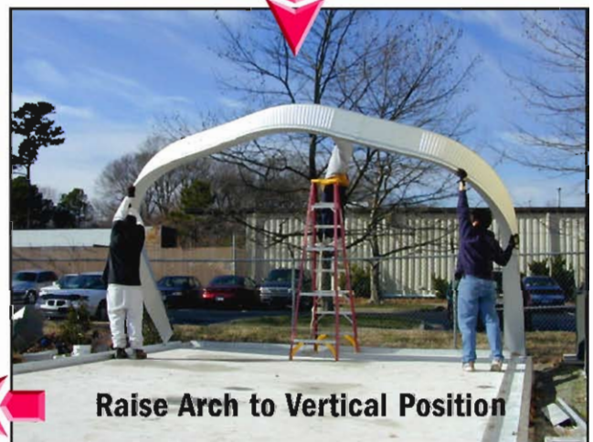
Raise Arch to Vertical Position