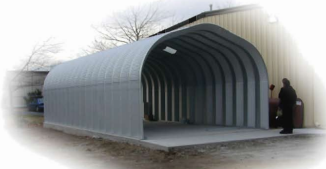
A Few Hours Later...