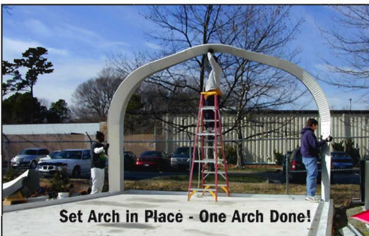
Set Arch in Place - One Arch Done!