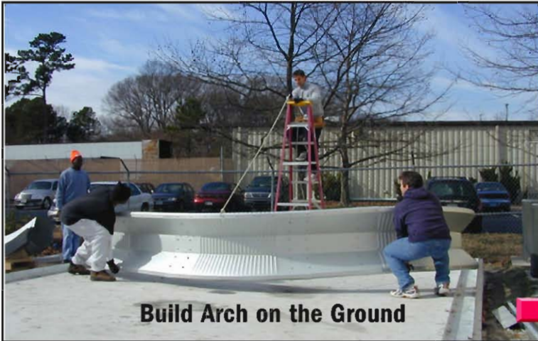
Build Arch on the Ground

"The Leader in Arch-Type Steel Buildings"